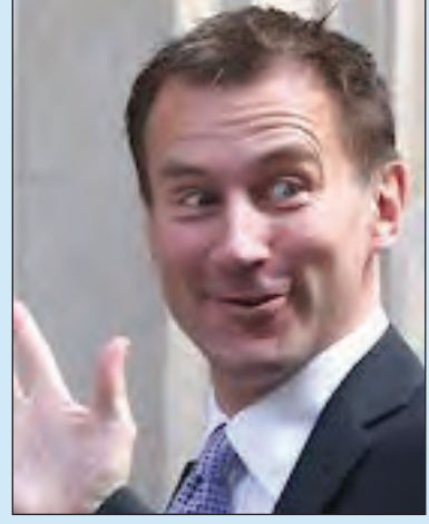
Health Secretary Jeremy Hunt is signing off on cuts - but not to PFI national headlines as its massive and costly PFI scheme has lurched predictably out of control.

But the first PFI Trust to suffer this indignity might well have been our own struggling Peterborough and Stamford NHS Foundation Trust, which has repeatedly hit