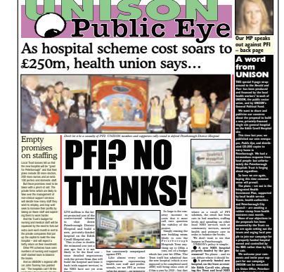
UNISON published supplements to the Herald & Post to warn everyone of the costs of PFI

In 2001, the cost of the scheme had grown to £135m, but the level of repayments would have posed problems for a Trust which then