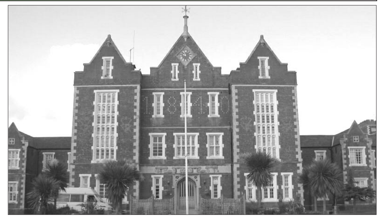
Springfield: even the smartest bit was built in 1840. Isn't it time for some modernisation?