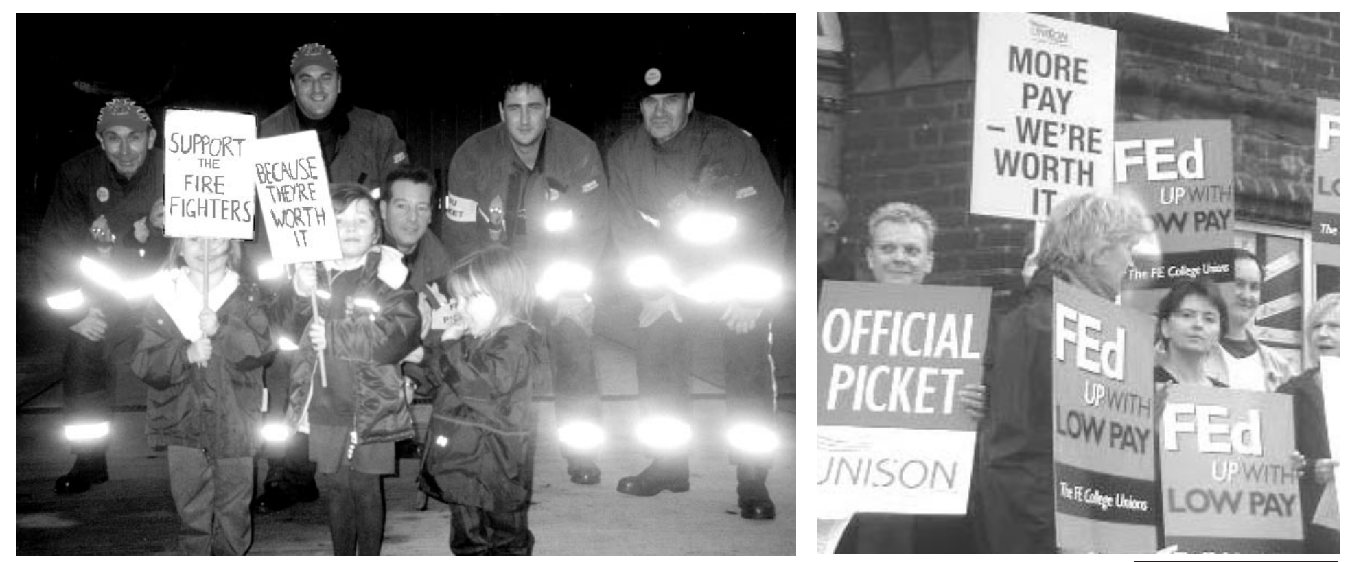
Kingston firefighters ... winning youthful support, and encouraging others, like staff at South Thames College, to fight back against low pay

South West London & St George's Mental Health Trust Branch