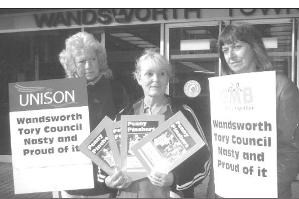
Wandsworth council's policy of privatising home care services has been exposed in "Penny Pinchers", a report for the council unionsand Battersea & Wandsworth TUC.

Staff have also warned that it is only a matter of