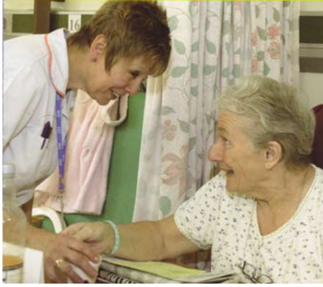
Caring for staff helps them care better for patients – see back page

And staff facing impossibly stuffy, hot working environment as the new building opened were told not to open the windows to allow the air conditioning to take effect – until it became clear that the