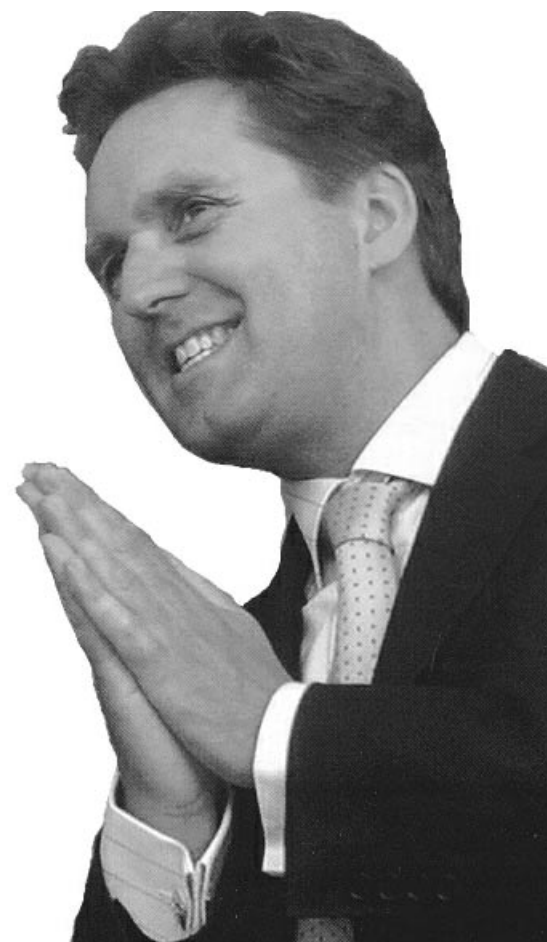
Milburn: should he be released into the community?