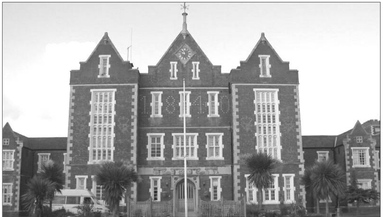
Springfield: even the smartest bit was built in 1840. Isn't it time for some modernisation?