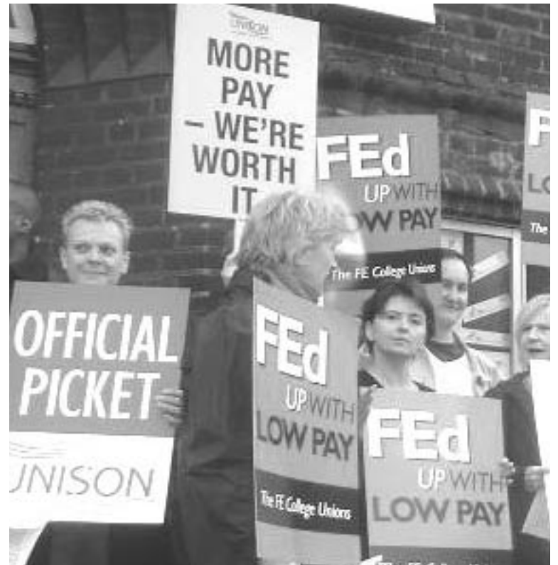
Kingston firefighters ... winning youthful support, and encouraging others, like staff at South Thames College, to fight back against low pay

As this issue of the UNISON bulletin was being written the firefighters were still in dispute over their campaign for a decent living wage.