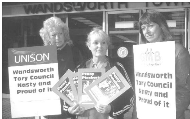
Wandsworth council's policy of privatising home care services has been exposed in "Penny Pinchers", a report for the council unions and Battersea & Wandsworth TUC.

time before there is another serious incident resulting in a wholly preventable death.