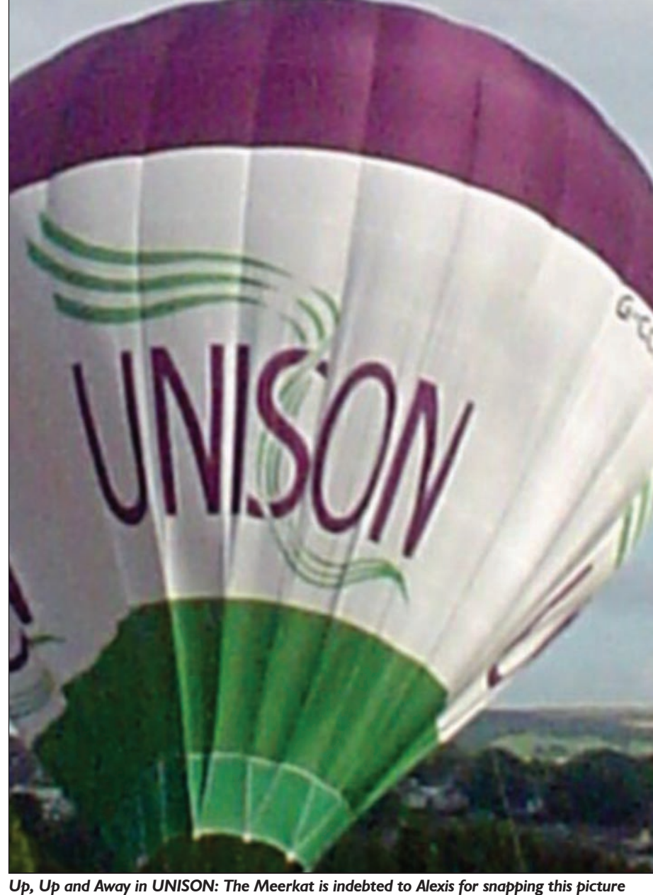
which shows one of the few times when UNISON is full of hot air.

Keep international issues on the agenda for